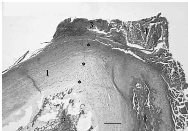
Fig. (2). Cross-section of a rat disc 3 weeks after disc puncture. The dorsolateral aspect of the disc is upwards in the picture. The dorsal surface of the disc is upper left and the ventral aspect is lower right. The annulus fibrosus (1) is surrounding the nucleus pulposus (2). A nodule (3) has been formed over the incision channel, which is indicated by asterisks. The nodule is just medial to the nerve root (4) and the psoas major muscle (5). (Bar 100µm).

identified. The tissue was defined as granulation tissue before remodelling. These were consistent findings in all analysed specimens. The osteophytes comprised thickening of the cortical bone (Fig. 3).